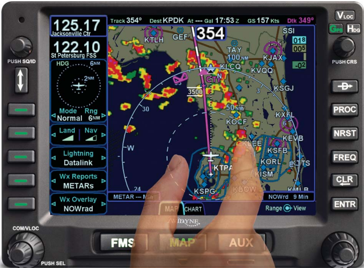
Pinch-Zoom with MultiTouch.