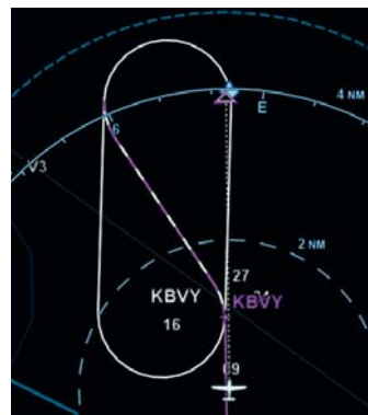
The segmented magenta line makes it very easy to see the next leg in the flight plan.

dramatically reduces the number of pilot actions. In fact, there is a high probability that it will display your desired waypoint on the initial suggestion.