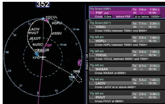
Avidyne's FMS900w allows the selection and guidance to all ARINC 424 leg types, including constant radius arc (RF) legs used in curved RNAV/RNP procedures.

During the transition between the en route and terminal phases of flight, these systems are essentially "coasting" in a heading mode, which is not corrected for wind and ground track. As a key feature of Avidyne's Flying Made Simple™ philosophy, the pilot is given FMS guidance for the entire route of flight, from 200 AGL to 200 AGL, without the need to suspend or interrupt guidance to the Autopilot, enhancing safety and eliminating "modes' confusion. The pilot simply "flies the magenta line" all the time.