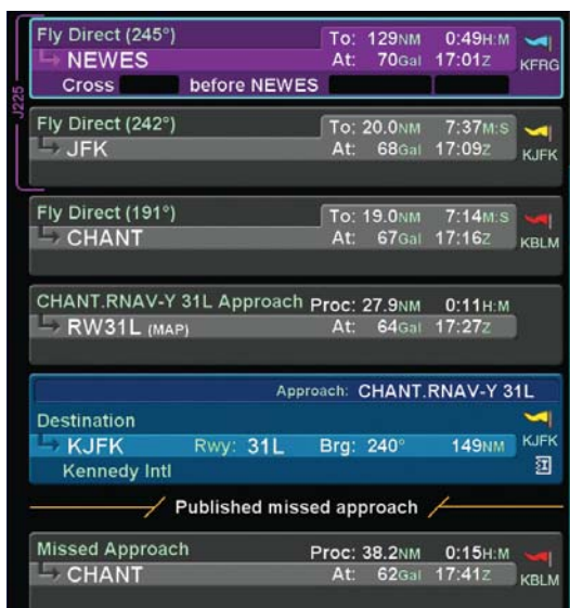
Graphical METAR flags for each leg of the flight plan provide at-a-glance weather updates all along the route. CMax electronic approach charts can also be instantly accessed for any airport in the flight plan. An "I" inside the Chart icon indicates that there is an ILS approach available.

Creating and editing Flight Plans is quick and intuitive with Entegra Release 9. All basic functions are easily accessible through the bezel controls or through the optional ACD215 Control/Display Unit. All FMS operations can be performed without removing your hand from the knob of the IFD. All drop-down menus are context sensitive and choices are displayed in a prioritized order. Even the cursor is context sensitive and provides a clear indication of