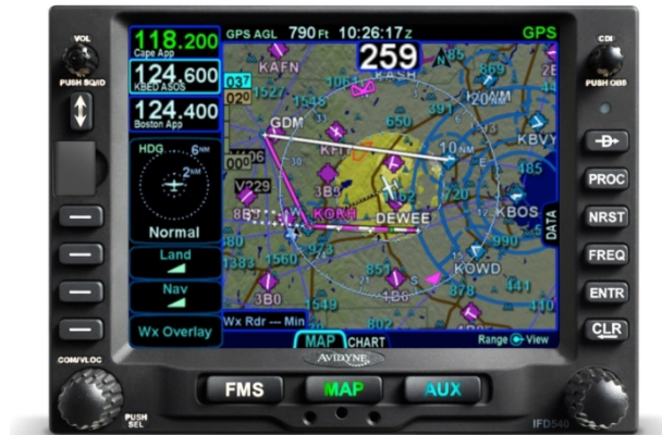
Figure 3: IFD540/510 Unit

The IFD5XX/IFD4XX System can be controlled using the button and knobs on the bezel of the unit. Alternately, some functions can be controlled using the touch-screen on the unit's display.