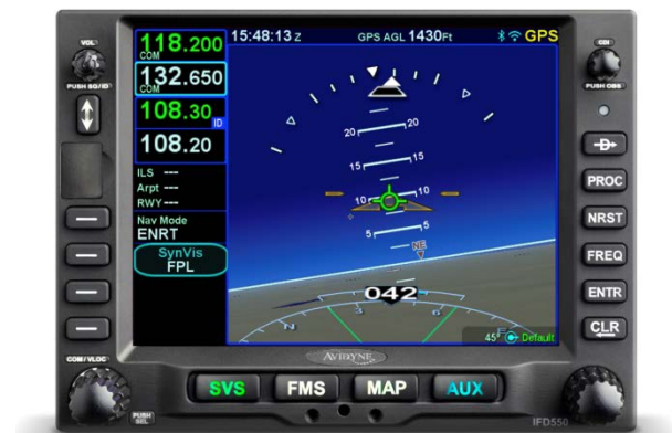
Figure 5: IFD545/550 Unit