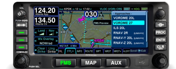
Figure 4: IFD4XX Unit