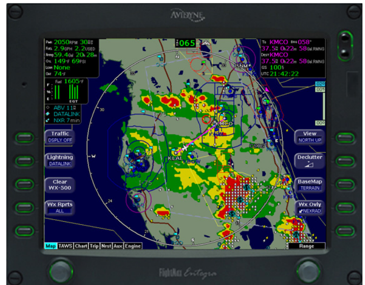
Entegra EX5000 MFD