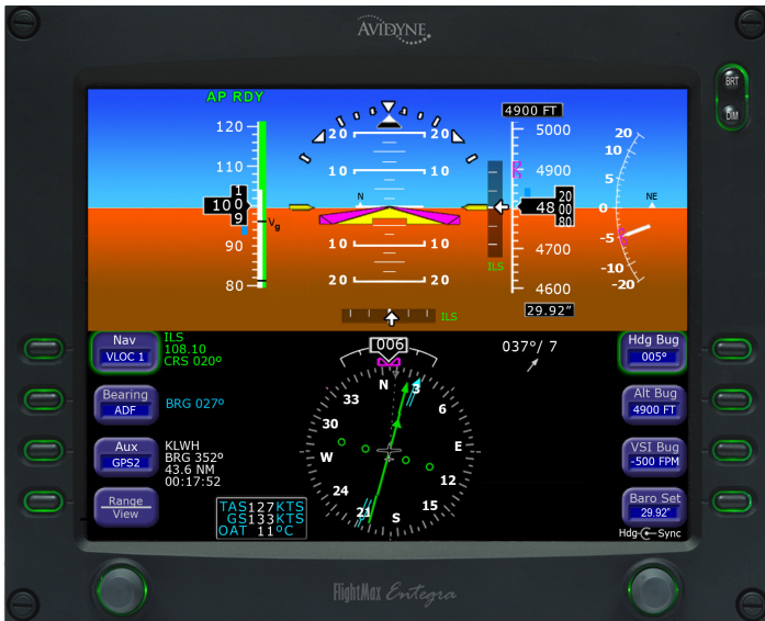
Entegra EXP5000 PFD