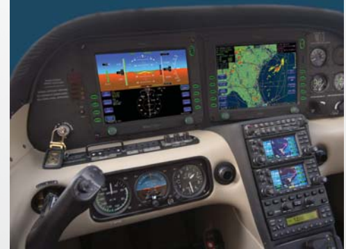
The DFC90 was initially certified as a replacement for the STEC55X in Entegra-equipped Cirrus SR20 & SR22 aircraft.

In Flight Director modes, all these actions appear as guidance cues with corrections blended into the "V-bar" commands. Even when the autopilot is off, the DFC90's Envelope Alerting (EA) provides aural and visual cues to the pilot when envelope exceedences are approached.