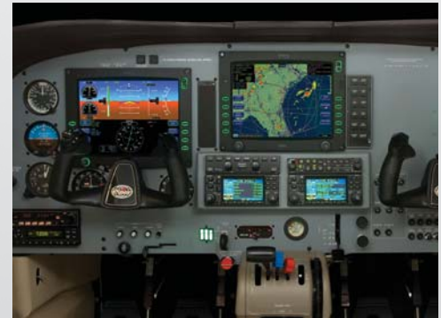
Entegra-equipped Piper PA-46 Matrix and Mirage aircraft can now upgrade to the DFC90.