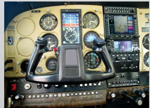
With the addition of an interface to the Aspen EFD1000 Pro, the DFC90 is becoming available to a growing list of aircraft including the Cessna 182 (above), the Beech Bonanza, and the Beech Baron.