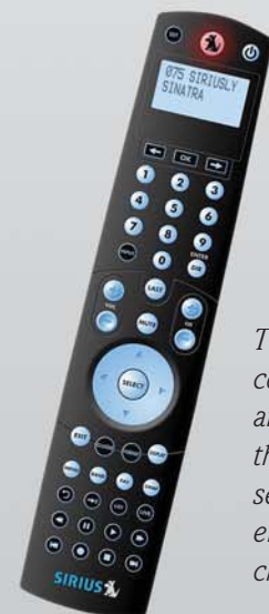
The RC70 remote control unit allows any passenger in the aircraft to select the audio entertainment channel.

With the MLB700 receiver, you have access to the SIRIUS® Satellite Radio Network, with over 130 channels of music, sports, news, and talk radio, right through your aircraft's audio system. Audio content is controlled using the RC70 wireless RF remote control.