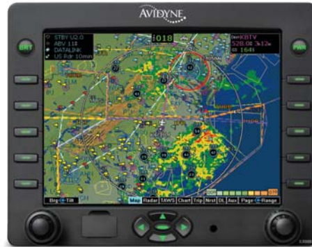
The MLB700 provides SIRIUS® Satellite Radio entertainment and Aviation-quality WSI InFlight® datalink graphical weather for Avidyne flight displays.

Avidyne MLB700 Receiver delivers Aviation-quality datalink graphical weather from WSI InFlight® and audio entertainment from SIRIUS® Satellite Radio.